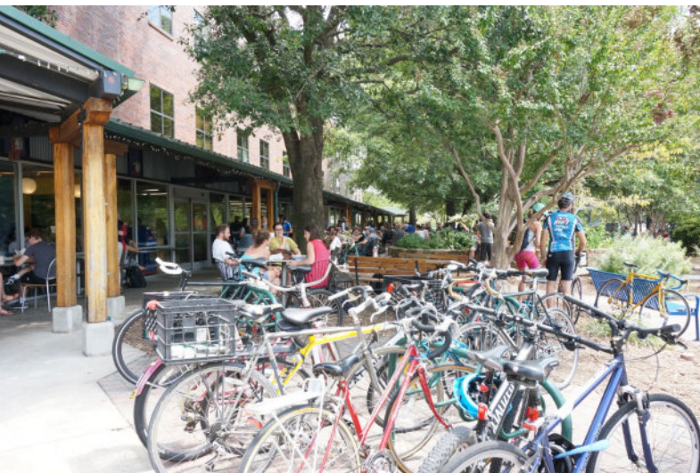
Weaver Street Market bike racks are often full.