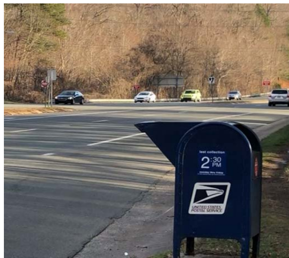
NC 54 is challenging for many people who bicycle.