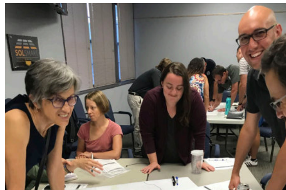
The steering committee meetings were interactive to encourage idea sharing during each meeting.